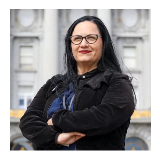
Superior Court of California Director of Collaborative Justice Programs